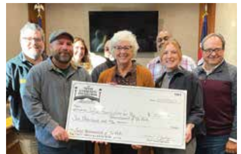
Tiffin Municipal Arts Commission