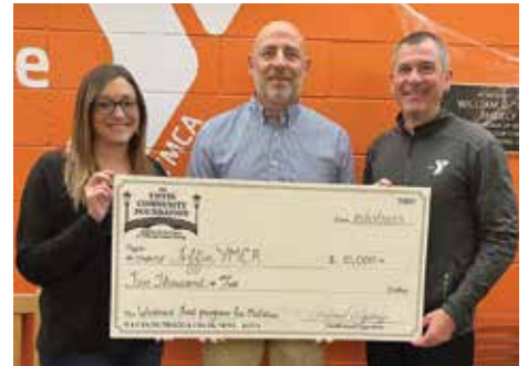
YMCA Backpack Food Program

We closed out our 40th year with 106 individual component funds, over $30 million in assets and $17 million worth of grants awarded since the creation of The Tiffin Community Foundation in 1983. We are so grateful for the continued support of our generous donors and look forward with excitement to the next 40 years!