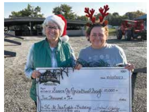
Seneca County Junior Fair Board